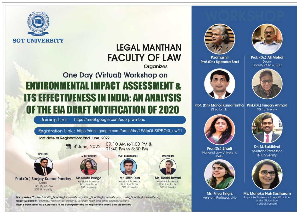
Figure:01 Banner of the event

Budhera, Gurugram-Badli Road, Gurugram (Haryana) – 122505 Ph. : 0124-2278183, 2278184, 2278185